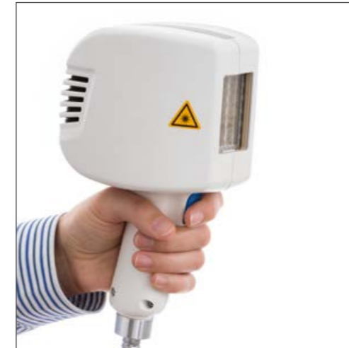
UVB EPL® 308 nm applicator