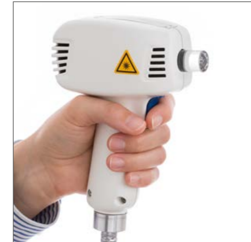
UVB EPL® lite 308 nm applicator